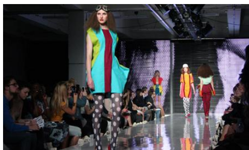
F Block G1